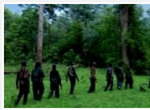
Joint operation against Maoists on in Jamui

They greet PM's call to scientists to solve "100 problems"