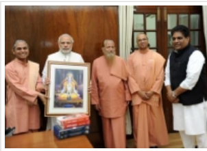
YSS celebrates 100 Foundation Day,holds Prabhat Pheri